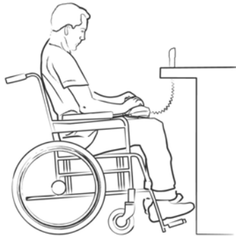
Disabled user with PED detached from mounting

Problems faced with card insertion in the correct orientation are of particular concern to users in wheelchairs, with Parkinson's disease or those that are blind. This can be alleviated by store staff assistance, contactless card technology, and detachable keypads. A keypad detachable from counter mountings that allows wheelchair bound customers to place it on their lap for transactions makes use easier and enables further compliance with disability acts.