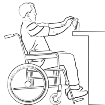
Positioning of counter mounted PED for disabled user

To accommodate different users it is necessary, or at least preferable, that the PED be on an adjustable mounting so that it can be viewed and reached from an appropriate and comfortable height and angle.